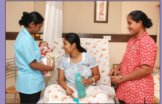
THE RARE EARTH

A Midwife, as a competent and independent health professional, should become an ideal choice for providing antenatal care to women with normal pregnancies, and for delivering their babies. Midwifery, if spread more widely, would make a big difference to both maternal and child health across India.